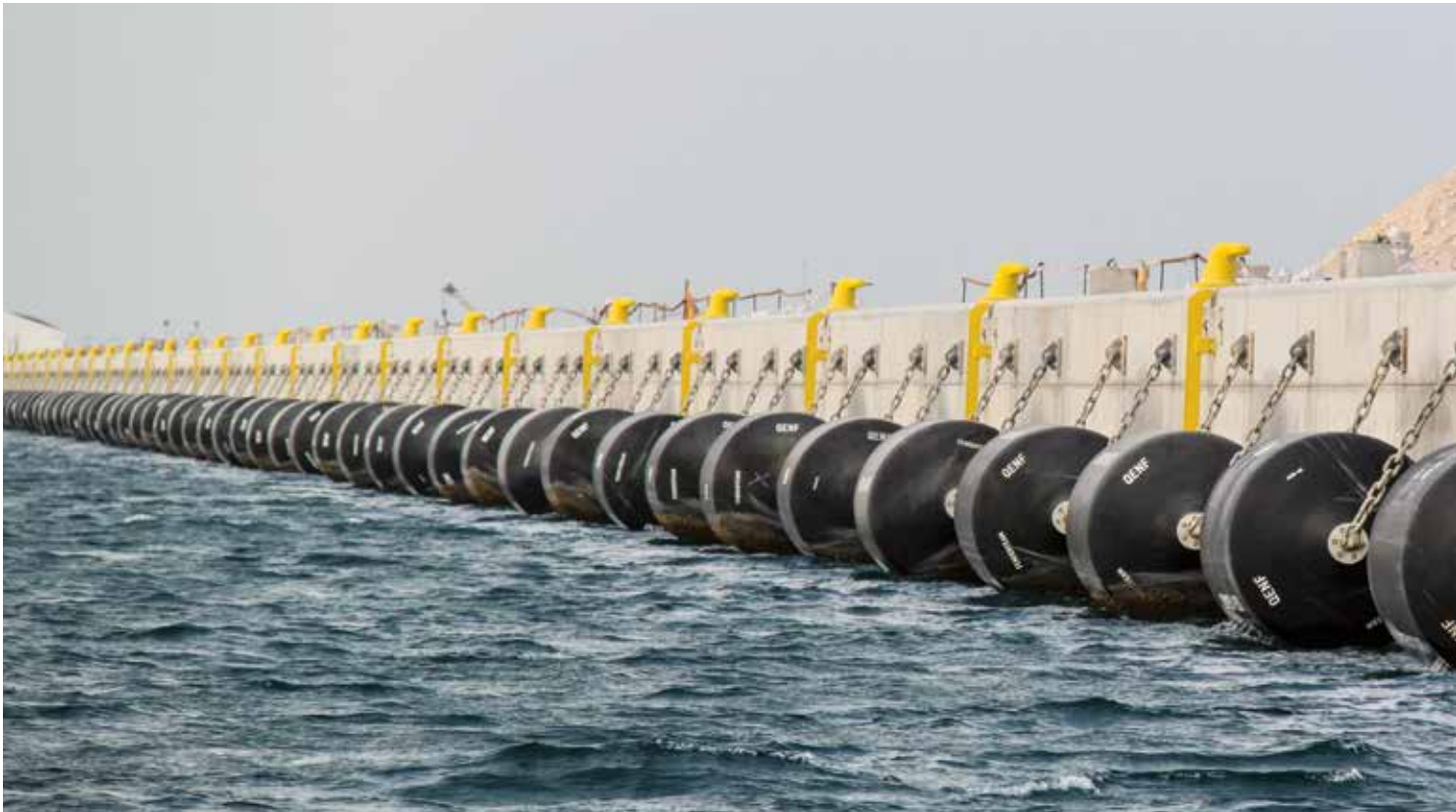
Naval Base | Doha | Qatar