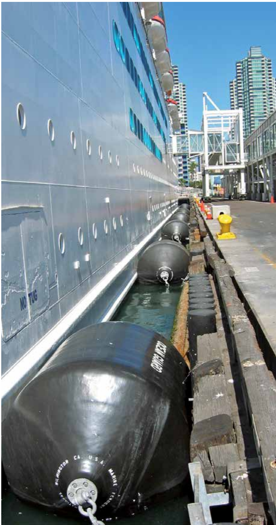
B Street Cruise Ship Terminal | San Diego, CA | USA