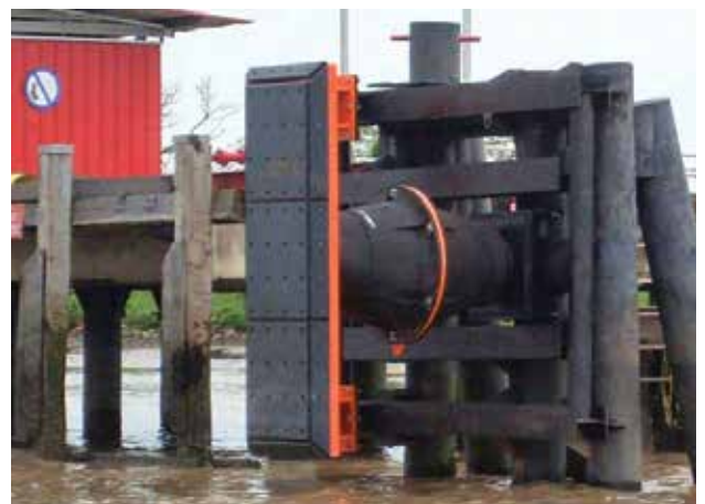
Esso Terminal | Paramaribo | Surinam