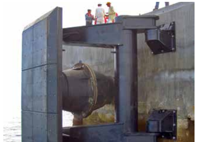
Oil Terminal | Labuan | Malaysia