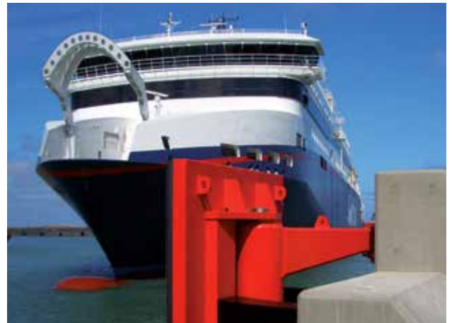
Ferry Berth | Hirtshals | Denmark