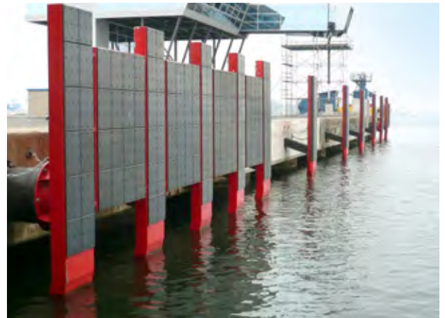
Ferry Terminal | Rostock | Germany