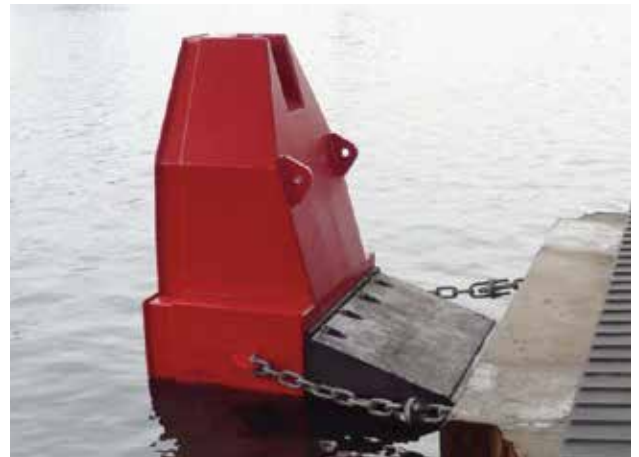
Ferry Terminal | Rostock | Germany