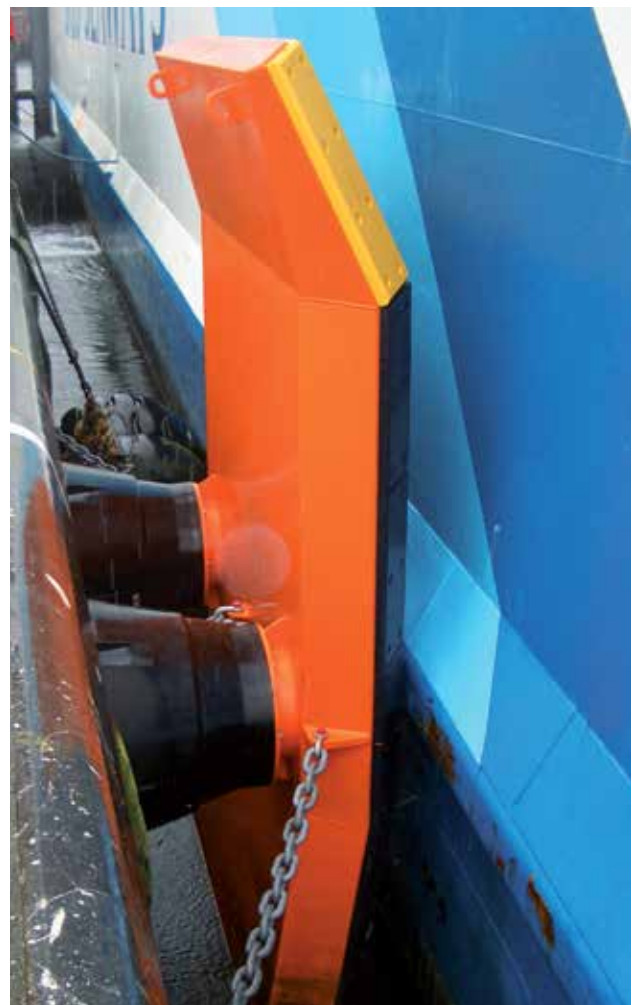
Ferry Terminal | IJmuiden | The Netherlands