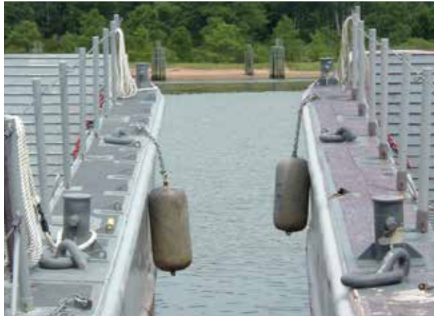
Navy Base | Norfolk, VA | USA