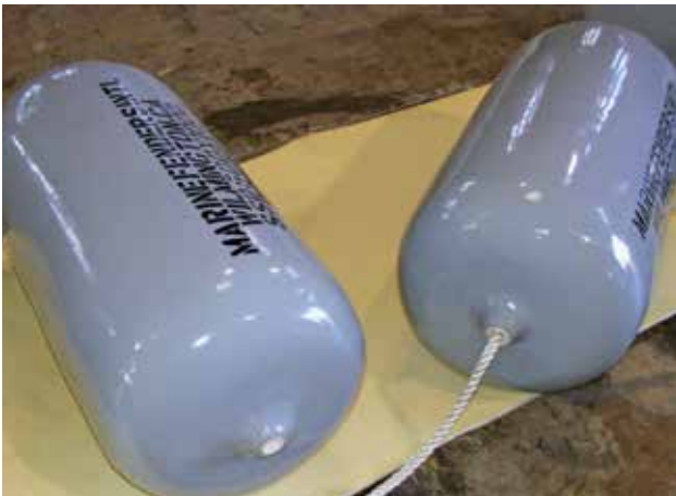
Navy Base | Norfolk, VA | USA